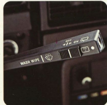
The rear window wiper, has an intermittent cycle on the 265GL, which is available for the 245. The control is on the steering column.

be changed by resetting a few bolts). The seats are supported internally for long-lasting resiliency and comfort and are designed, statistically, to fit 95% of the North American adult population. The rear seat is supported by springs and foam padding for greater comfort. There's ample leg and headroom for five adults. And, when you need extra cargo area, the rear seat conveniently folds forward.