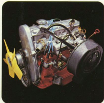
B21A, in-line, four-cylinder engine.

Also included with every Volvo wagon at no extra charge is one of the automobile industry's finest and most thorough durability pro-