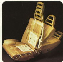
The Volvo seat adjust nine ways to give you a more comfortable ride.

The front passenger seat is also fully adjustable (the seat height can